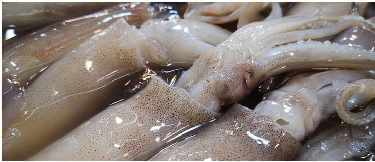
Fresh squid on display in a market.

anything illegal, and that it is the areas of ocean—not the vessels themselves—that are unregulated.